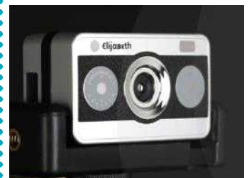
TRUONE co. Ltd Thermal Imaging Camera