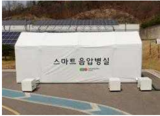
Shinsung E&G Smart NPIR, Puregate, PureLumi