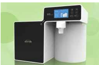
Seoulin Bioscience Slightly Acidic Electrolyzed Water SLB-120