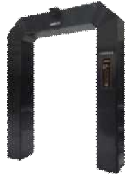
Caremile Inc CAREMiLE Body Sterilizer