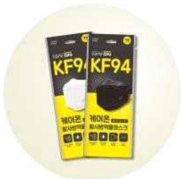
WELCRON HEALTHCARE Mask, Hand Sanitizers