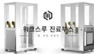
HWASUN MOTION-TECH COVID19 Walk through diagnostic booth