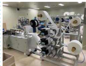
Venishoo Co.,Ltd. mask production machine