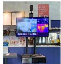
Redmouse Real Time AI Thermal Imaging Camera,