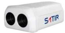
METEOR thermal imaging camera