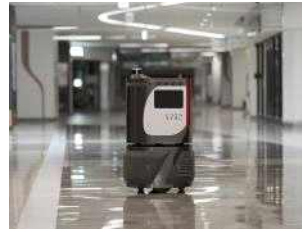
Dogugonggan Co., Ltd. D-BOT Disinfection