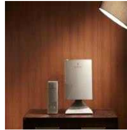
Gatevision Co., Ltd. Novaerus Air Sterilizer