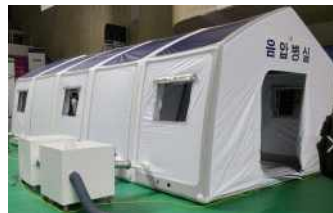
WOOSUNG IB Negative pressure isolation tent