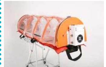
WOSEM Co.,Ltd Negative Pressure Carrier