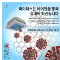
MEDIFIBER VirusBuster BLUE MASK, VirusBuster FILTER