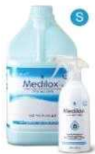
SOOSAN CMC CO.,LTD Medilox