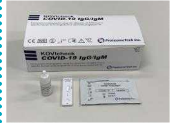
Proteometech KOVCheck COVID-19 IgG/IgM